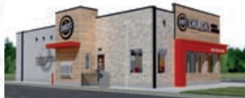
BLAZE IMAGE DRIVE - THRU RESTAURANT