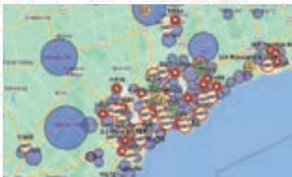
STRATEGIC MARKET MAPS